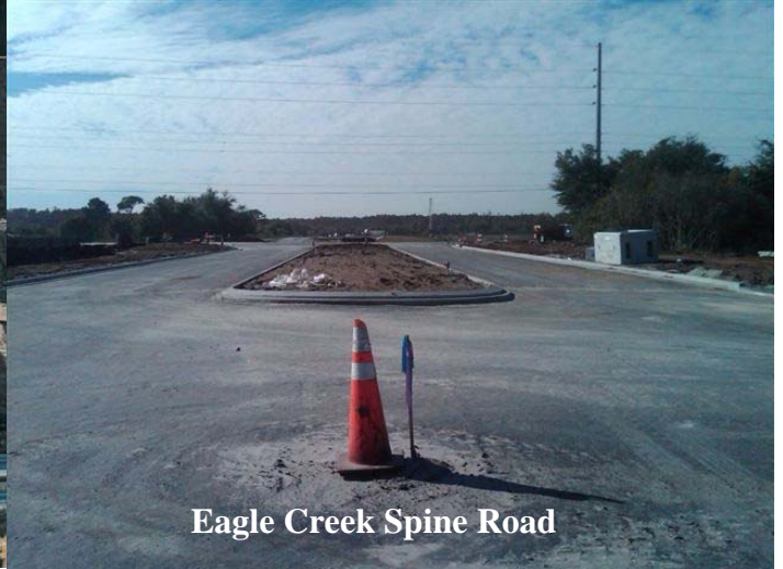
Eagle Creek Spine Road