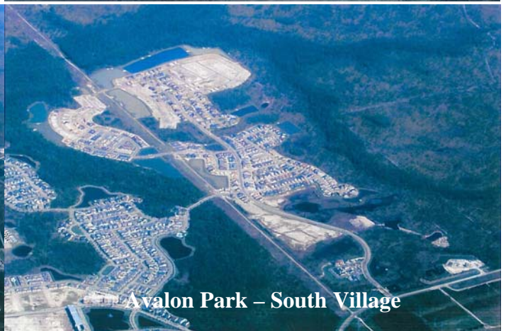
Avalon Park – South Village