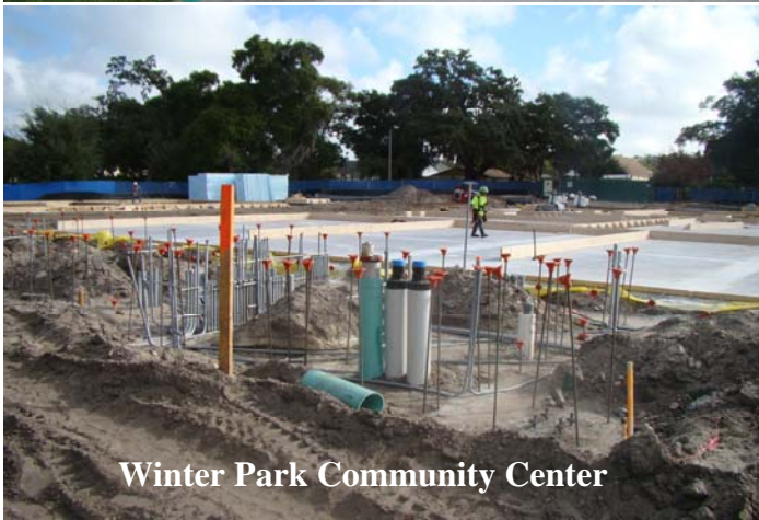
Winter Park Community Center