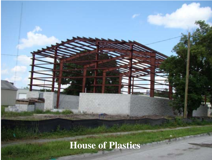
House of Plastics