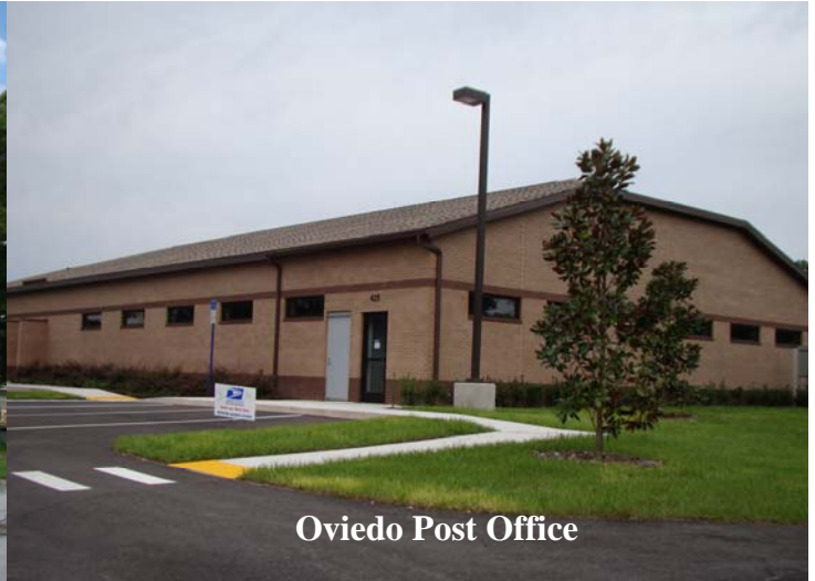
Oviedo Post Office