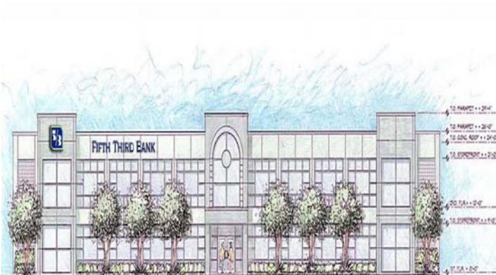
Avalon Lakes Center