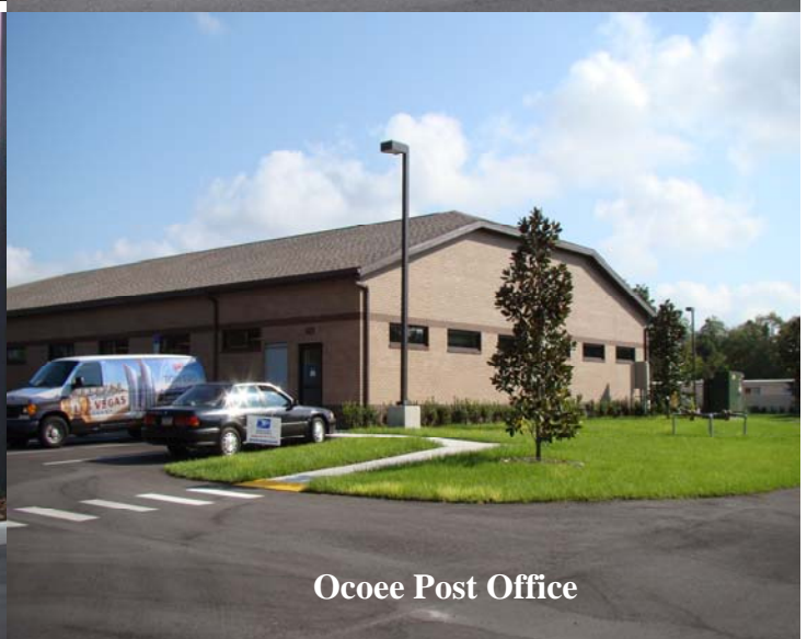
Ocoee Post Office