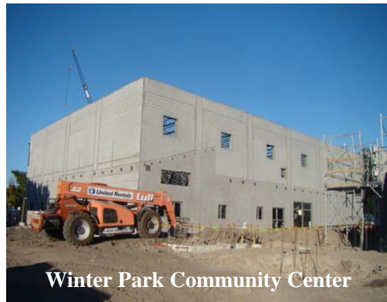
Winter Park Community Center